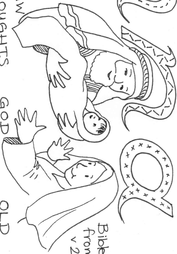
Bible Story from Luke 2 v 22-38